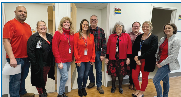
United Services staff wearing red to raise awareness for Women's Heart Month in February in the Dayville Primary Care suite.

United Services is currently only operating a primary care program within its Dayville Outpatient Clinic for individuals who are already receiving services at USI and do not currently have a primary care physician. The agency plans to open a primary care program at its Mansfield Outpatient Clinic in 2025.