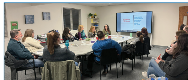
United Services hosted a Parent Information session on Human Trafficking February 22 at its Wauregan Center.