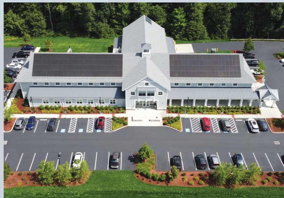
United Services Windham Regional Health and Wellness Center at 140 North Frontage Road, Mansfield Center.