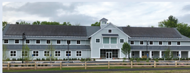
Windham Regional Health and Wellness Center 140 North Frontage Road, Mansfield Center, CT