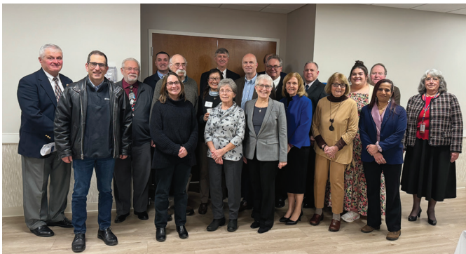
United Services Board members with our State Legislative Delegation at our annual briefing.

January 2024: United Services annual Legislative Briefing with our State Legislative Delegation.